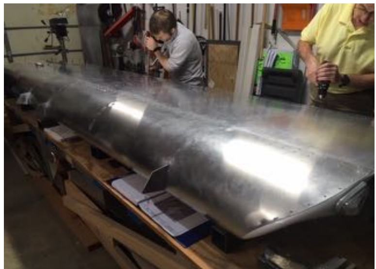
Photo below is from the Zenith CH701 build