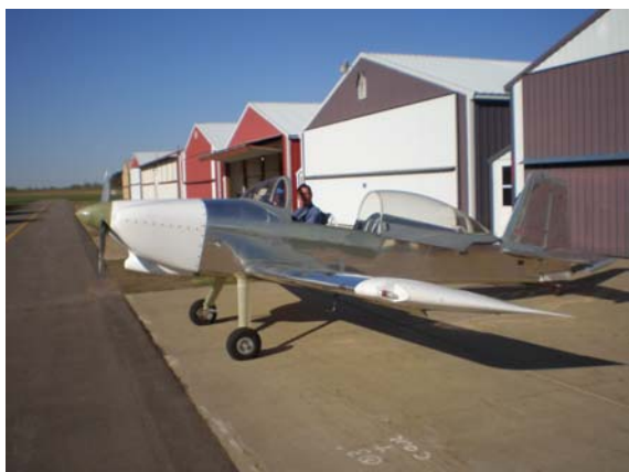
Ready to Roll