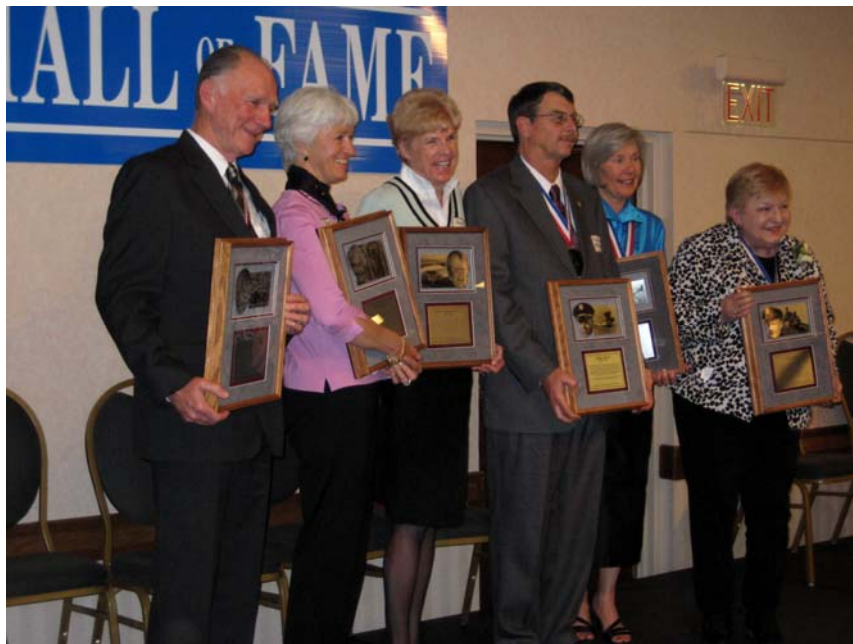
Recipients/family representatives pose with award plaques after the induction ceremony

The MN Aviation Hall of Fame held its annual induction banquet on May 3rd at the Ramada Mall of America. Inducted this year were: