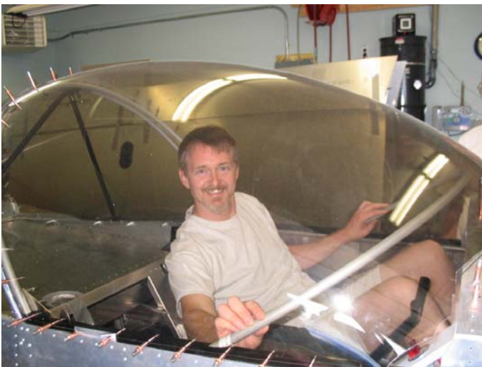
Plenty of headroom