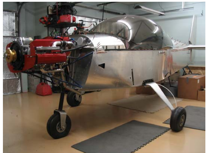
Need a bigger garage