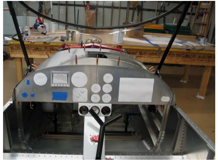
Early Panel Planning