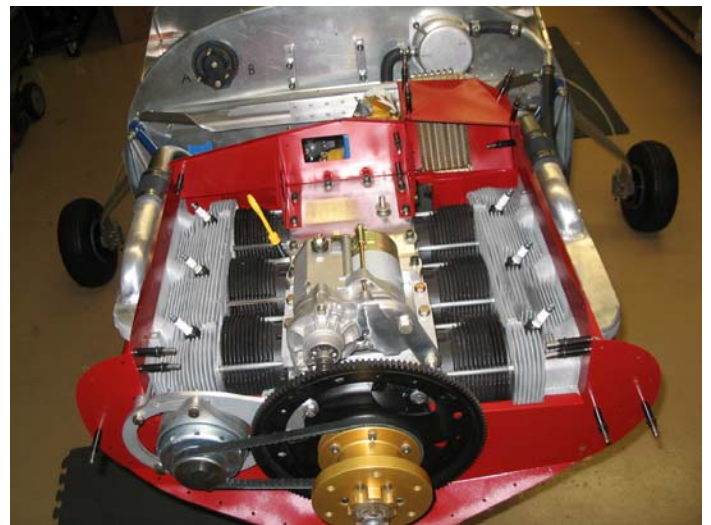
Fitting the baffles