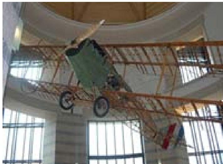
1918 Curtiss JN4D Jenny Restoration Minnesota History Museum