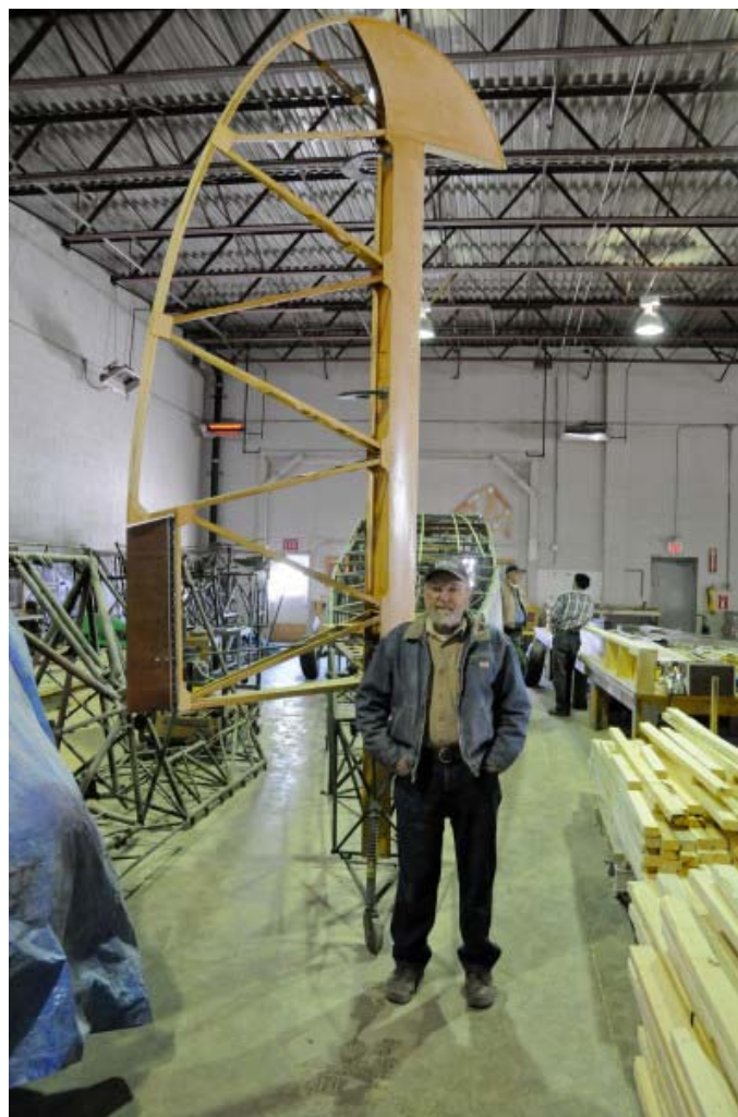
Rudder - Waco CG-4 Builder: Dale at Villaume Industries